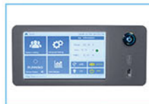
LCD touch screen