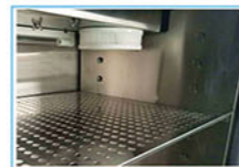
HEPA filter (for water jacket)