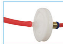
CO 2 gas filter