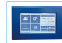
LCD touch screen