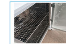
Push-pull shelves with holes